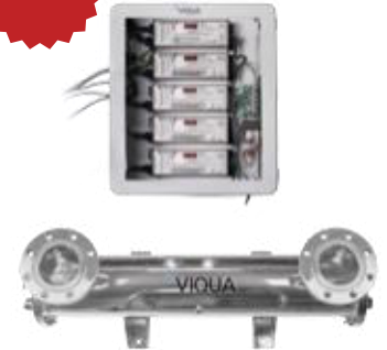
Powered by Sterilight