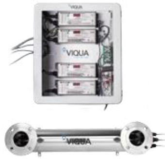
Powered by Sterilight