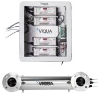
Powered by Sterilight